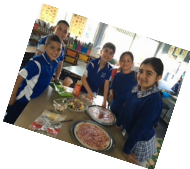
3/4R learnt how to make a pizza.