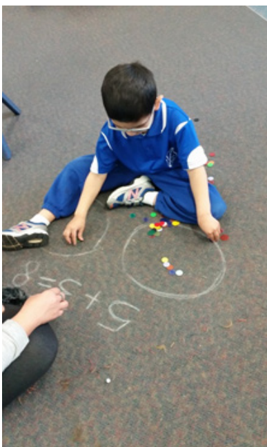
Working hard in maths.