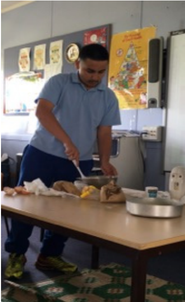
5/6S showcased their cooking skills by baking a cake.