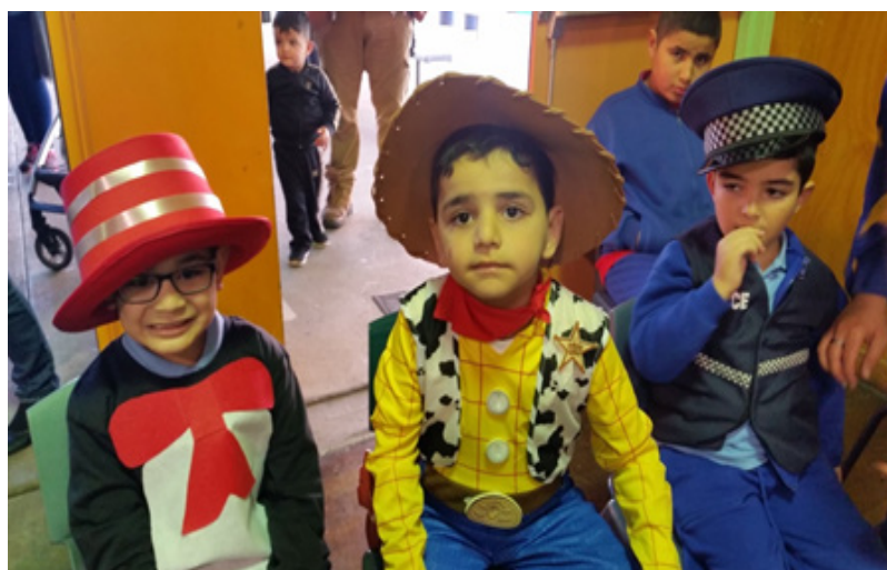
Dressing up for Book Week.