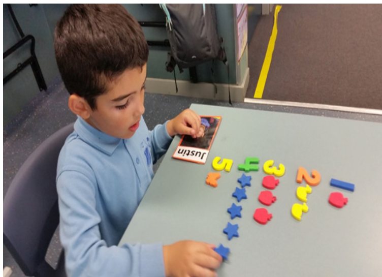
Learning about numbers.