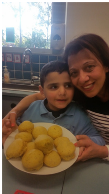
Our very own baked bread.