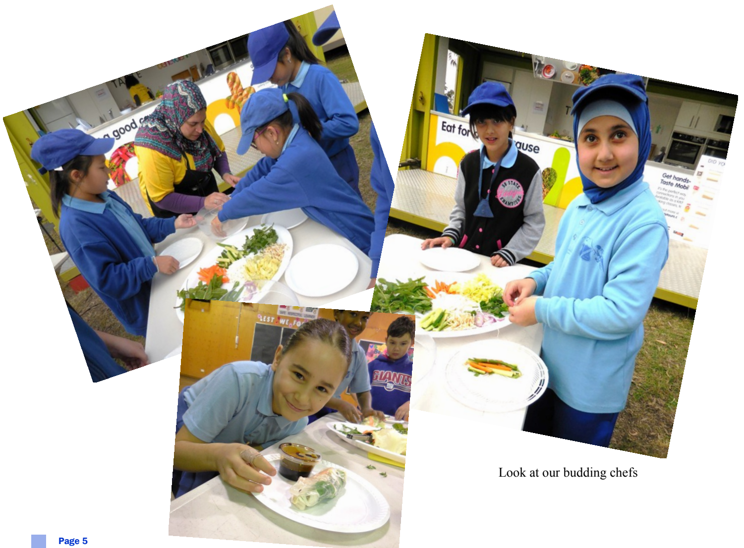
Look at our budding chefs