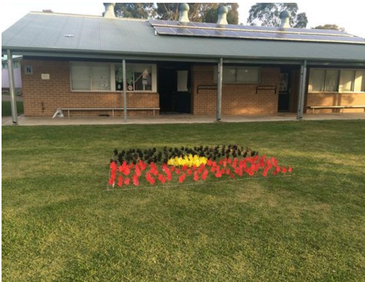
Sea of red, yellow and black hands to create the Aboriginal Flag

National Reconciliation Week 2015 27 May to 3 June